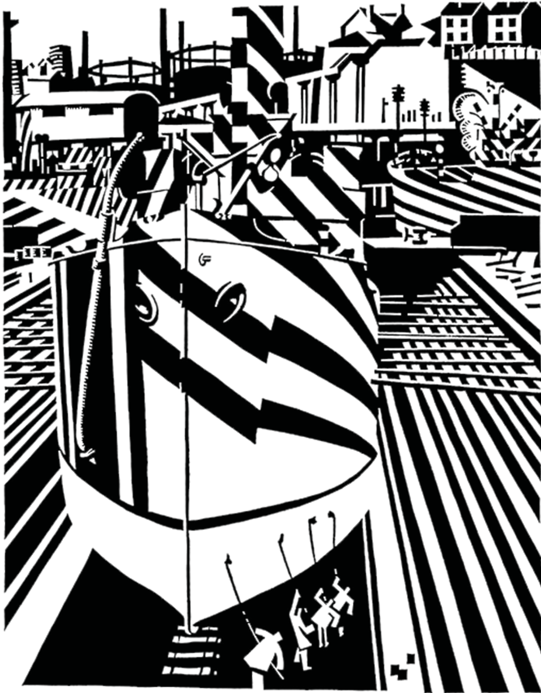
Dazzle-ships in Drydock at Liverpool, Edward Wadsworth, 1919

This building was given to the City of Liverpool by the Blue Star Line whose ocean-goers took thousands to New York and beyond in style. However, this is not one of those luxury liners. Instead, it's a dazzle ship, the fruit of a short-lived experiment when war machine met psychedelic art.