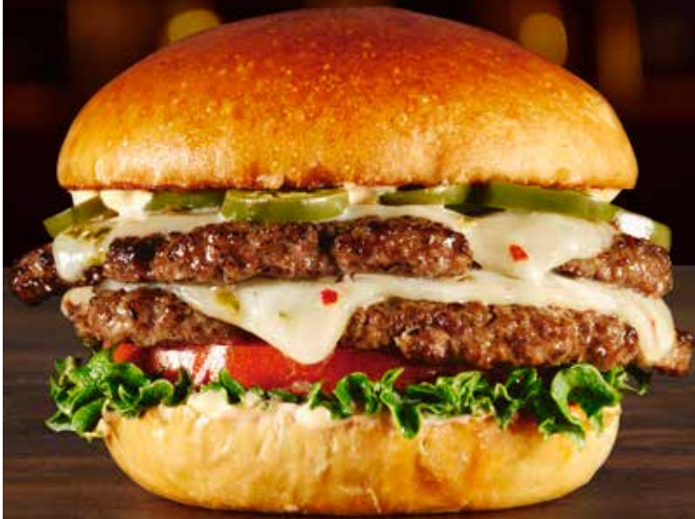
Spicy Diablo Smashed Burger