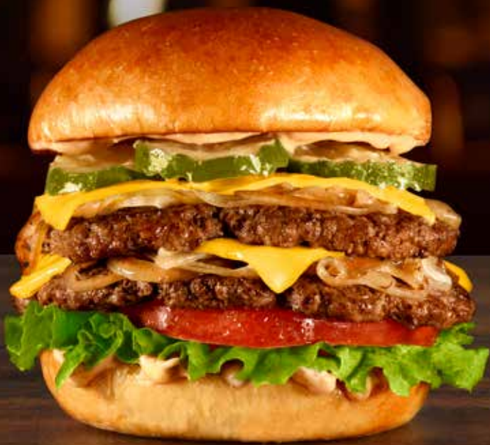
The Classic Smashed Burger