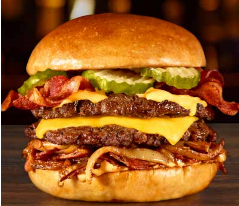
Legendary® Smashed Burger