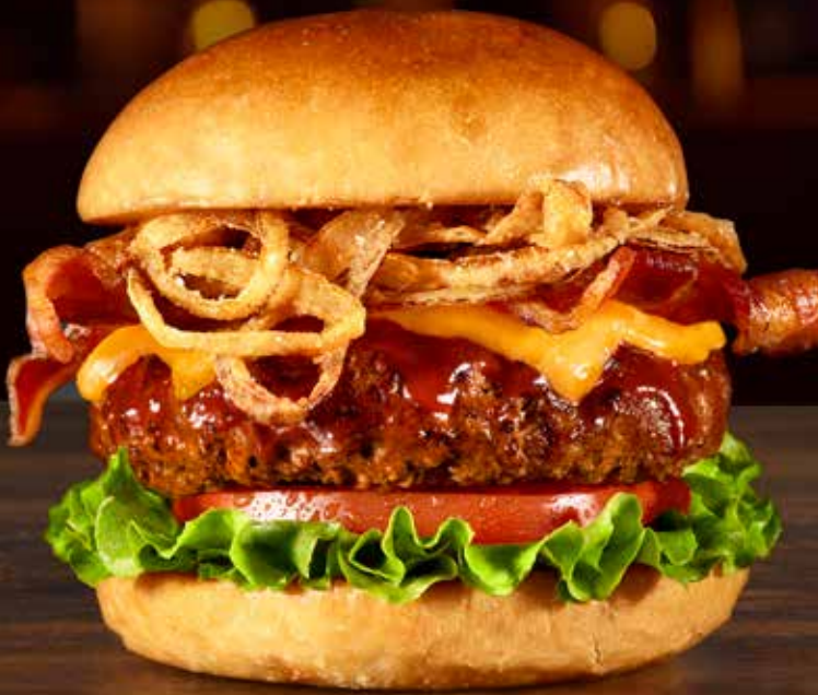
BBQ Bacon Burger