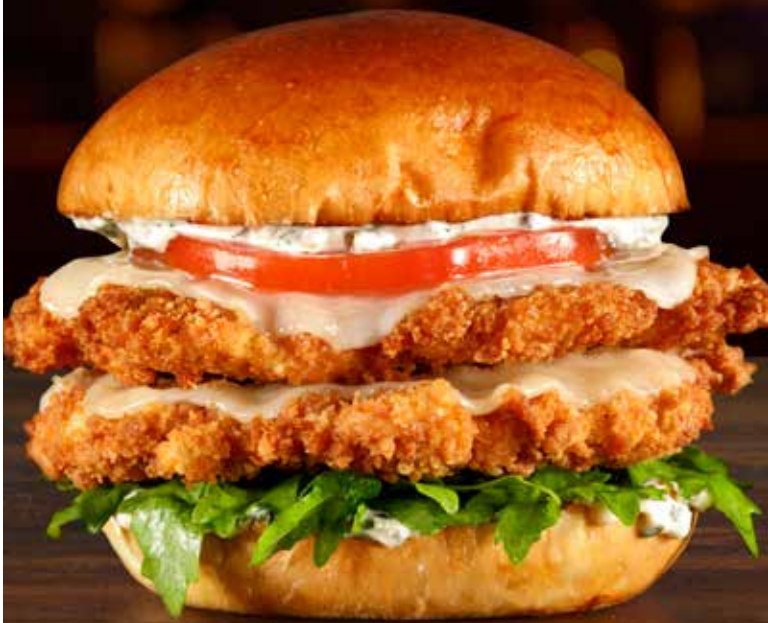
Messi Chicken Sandwich