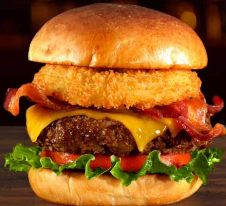
Original Legendary® Burger