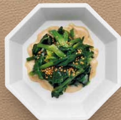
HORENSO NO GOMA Blanched spinach with soya sesame & goma dressing £6