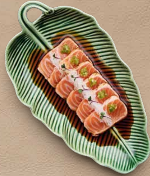
SHAKE TATAKI Salmon, daikon, cress, kizami wasabi & ponzu £11