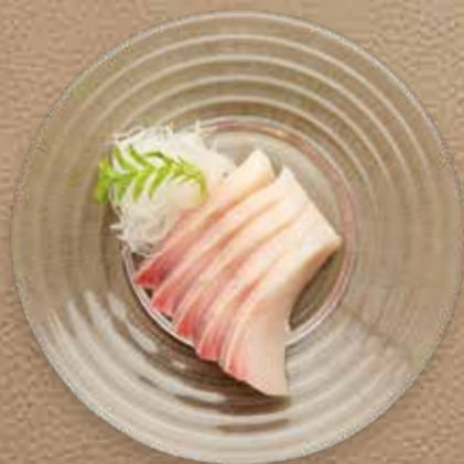
HIRAMASA Yellowtail kingfish. £14.20