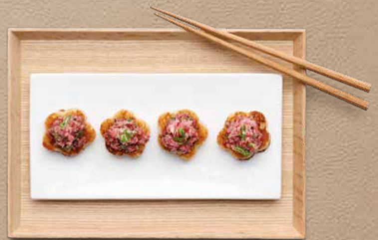
WAGYU BITES Wagyu tartare with shiso, spring onion and kizami wasabi on toasted bread £21

Add on: EXMOOR CAVIAR Royal Beluski [10 gr] £21