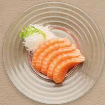
SHAKE Salmon. £8.60