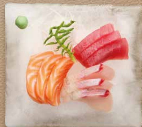
SASHIMI MIX Salmon, yellowfin tuna and hiramasa £19.60

TUNA TARTARE. Tuna, avocado, sesame, miso, yuzu, spring onion and crispy flat bread SHAKE CARPACCIO. Salmon, miso aioli, trout roe, chives, daikon & lime marinade MAGURO TATAKI. Seared tuna, yuzu-kosho, wafu dressing, soya sesame and daikon cress HIRAMASA KATAIFI. Hiramasa, kataifi, chives, shiso, truffle oil & ponzu HOTATE CEVICHE. Scallops, miso, chilli, coriander, red onion, celery & tiger's milk SHAKE TATAKI. Salmon, daikon, cress, kizami wasabi & ponzu £45