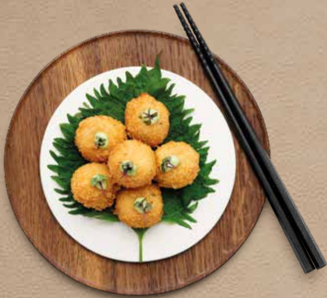
KANI KOROKKE Crab croquettes with wasabi caesar £10.60