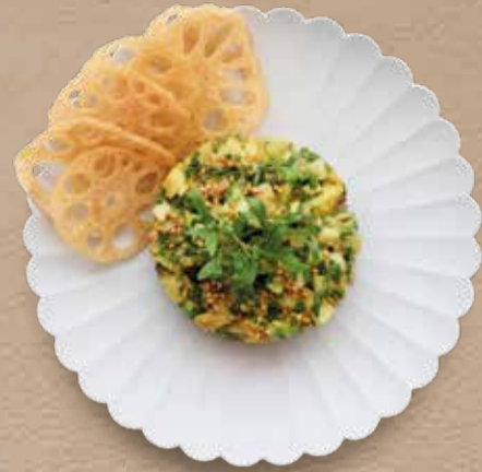
GREEN TARTARE Grilled broccoli marrow, ginger, yuzu, avocado, coriander & lotus chips £8