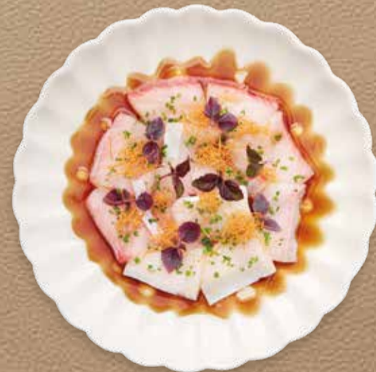
HIRAMASA KATAIFI Hiramasa, kataifi, chives, shiso, truffle oil & ponzu £14

Allergy information is available. Please ask your server.