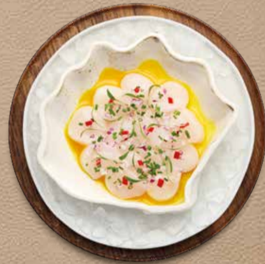
HOTATE CEVICHE Scallops, miso, chilli, coriander, red onion, celery & tiger's milk £11.80