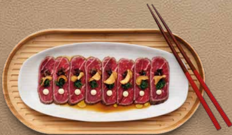
BEEF TATAKI Beef fillet with miso aioli, spring onion, root vegetable chips, shiitake & truffle ponzu £14