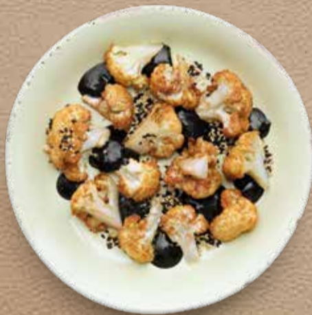
CAULIFLOWER Fried and served with black truffle goma £6.20