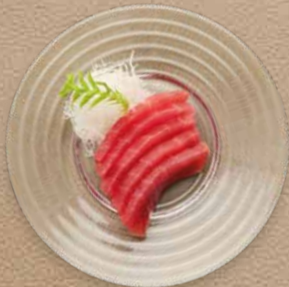
MAGURO Yellowfin tuna. £10.80