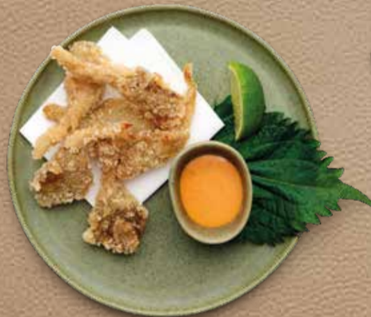
KINOKO KATZU Blue oyster mushroom with soya panko, lime & chilli dip £10.40

Add on: EXMOOR CAVIAR Royal Beluski [10 gr] £21