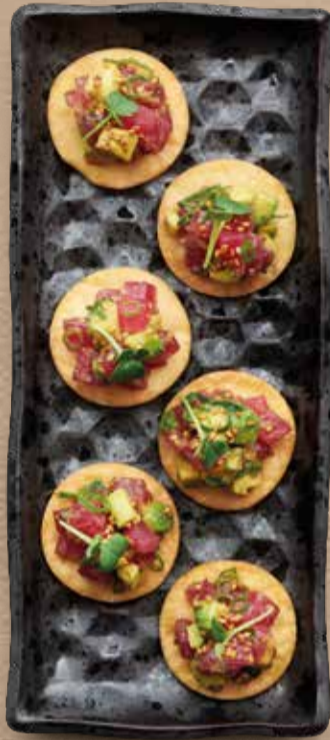
TUNA TARTARE BITES Tuna, avocado, sesame, miso, yuzu and spring onion on crispy flat bread £12.20