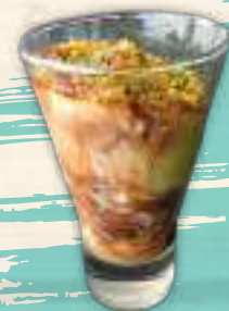
DELUXE PISTACHIO ICE CREAM