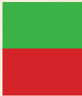
Table service only