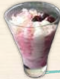
DELUXE CHERRY ICE CREAM