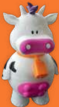
VANILLA ICE CREAM

VEGAN PIZZA FRESHLY ROLLED, TOMATO PIZZA SAUCE, VEGAN CHEESE AND BAKED TO ORDER (VG) £8.95