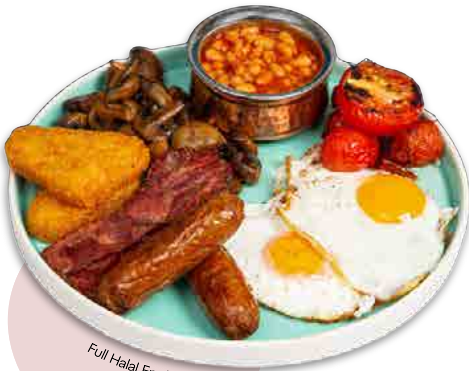
Full Halal English Breakfast