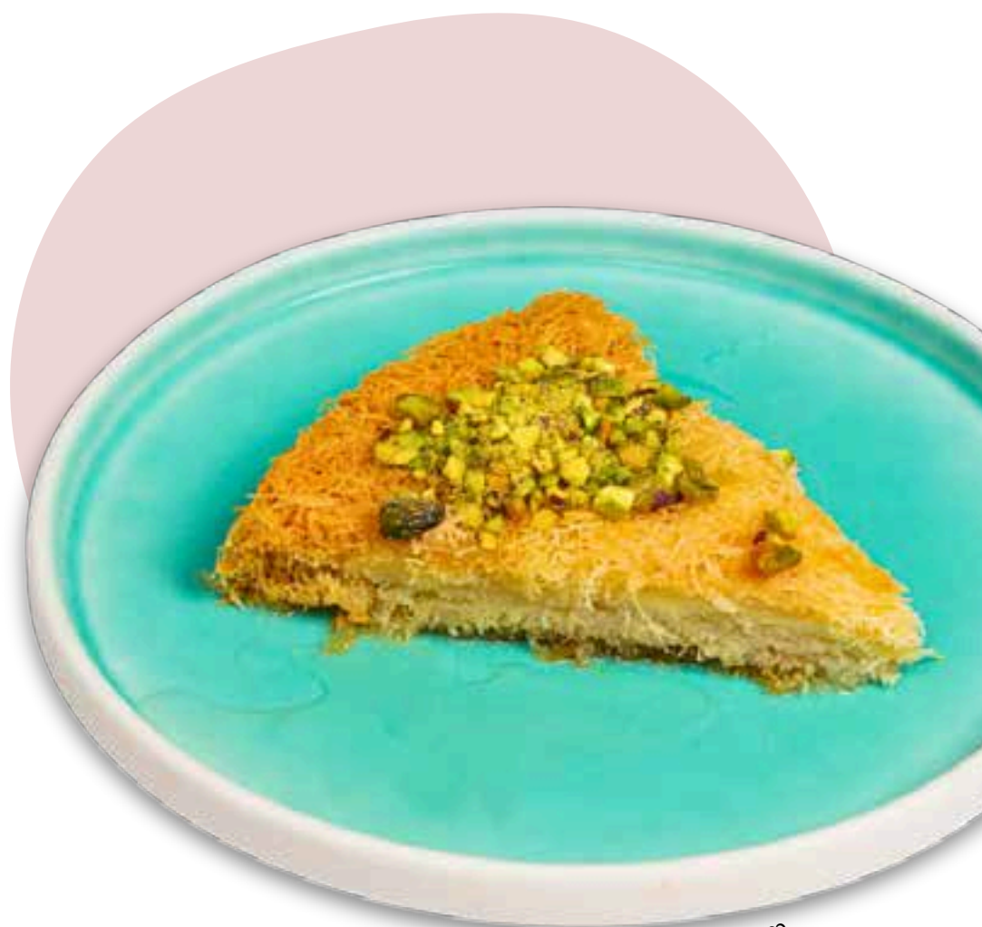
Konafa with Cream