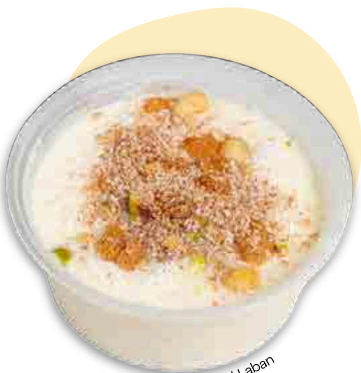
Roz Bel Laban

Roz Bel Laban with your choice of topping £6.90