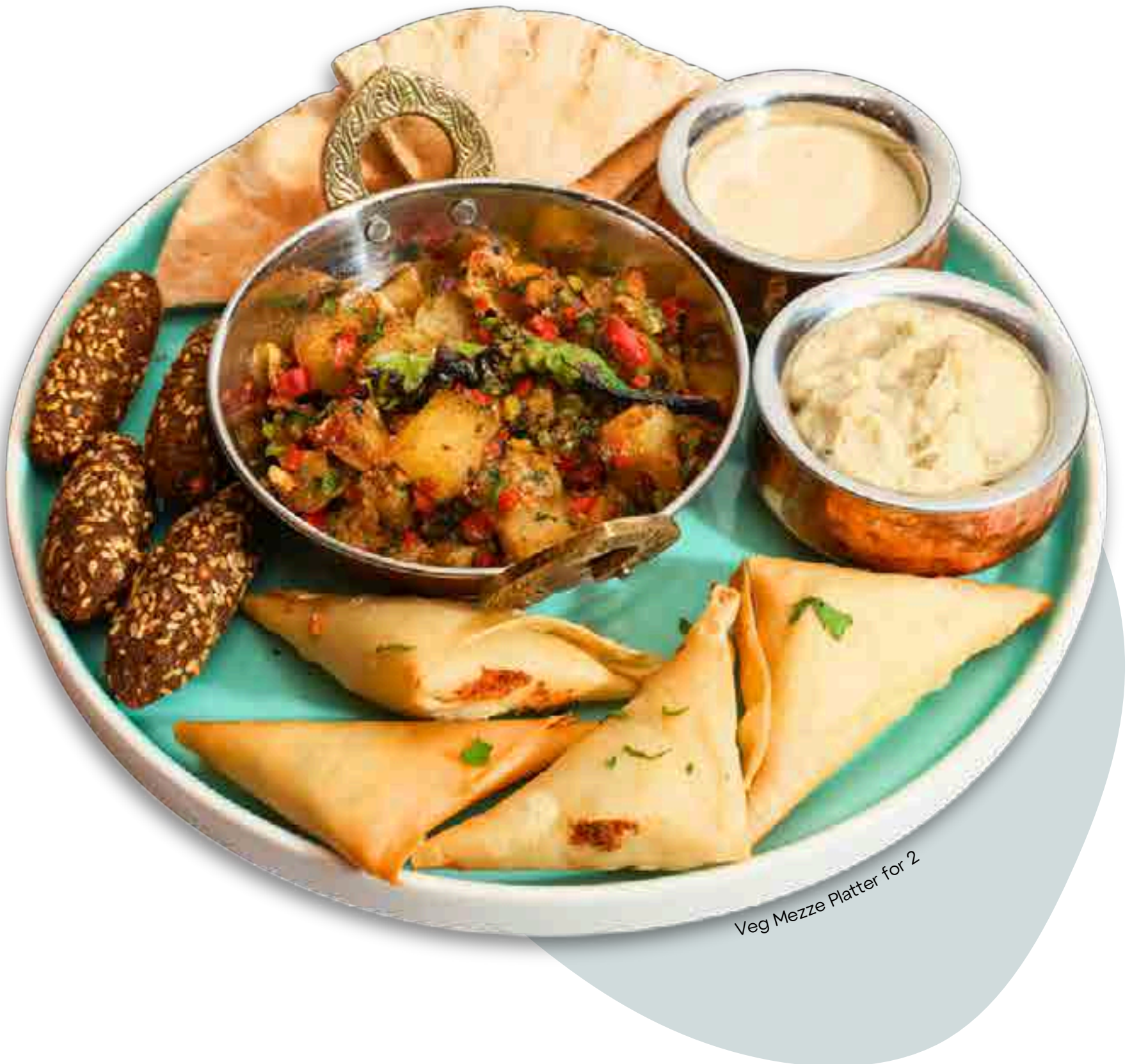
Veg Mezze Platter for 2