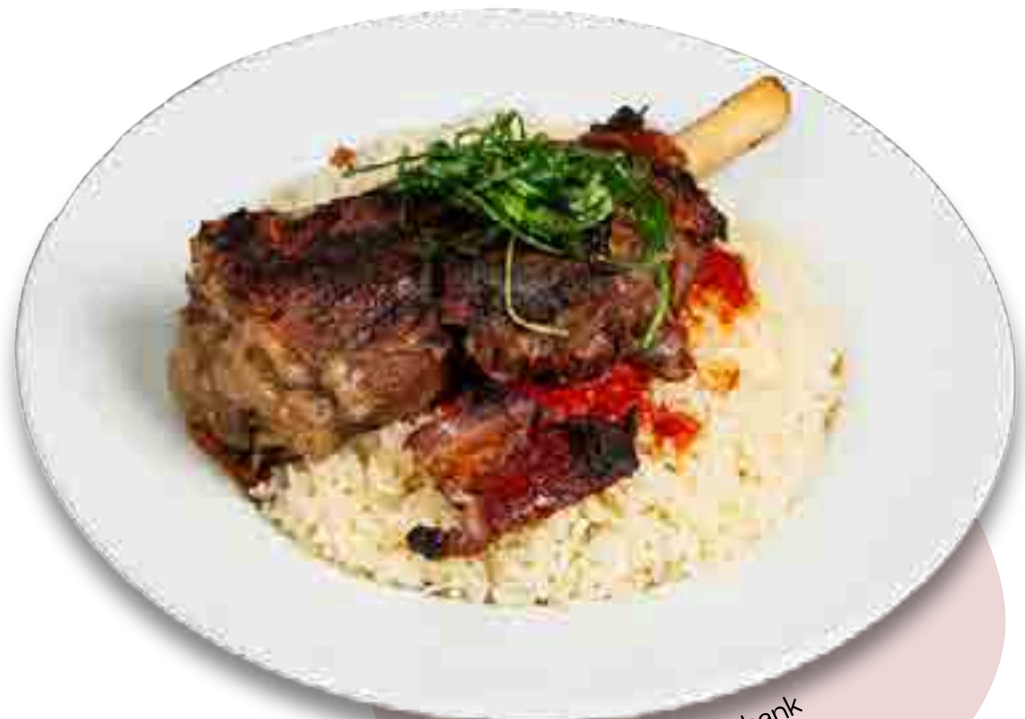
Fattah Lamb Shank

A signature Egyptian dish, consists of tender beef braised in a velvety sauce of caramelised onions served with rice and salad.