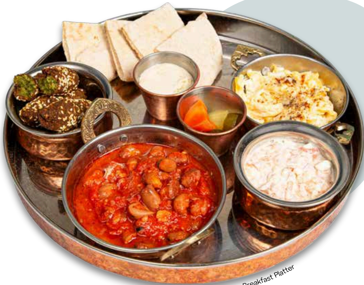
Full Alaz Breakfast Platter