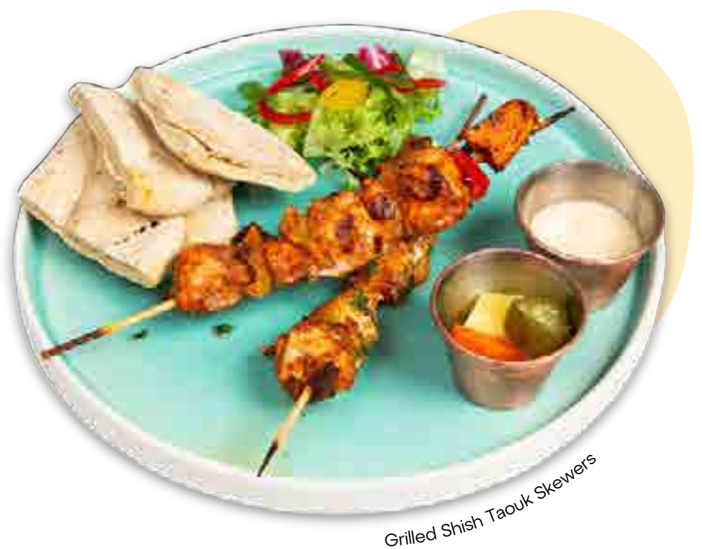
Grilled Shish Taouk Skewers

The Egyptian version of a lasagna dish made with Penne pasta, beef minced meat and topped with a creamy bechamel and Mozzarella cheese