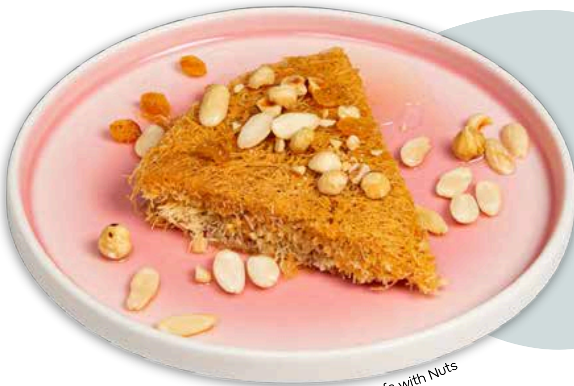
Konafa with Nuts