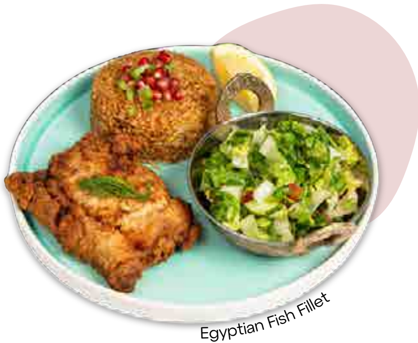
Egyptian Fish Fillet

1 skewer Lamb kebab, 1 skewer chicken kebab, 2 skewer Beef/Lamb Kofta, 4 lamb chops, 4 lamb ribs and chicken wings served with rice, tahini dip and salad