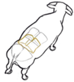
Fig.3 Porterhouse T-Bone