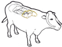
Fig.7 Prime Rib