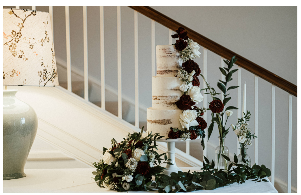
Donna & Ryan's autumnal wedding