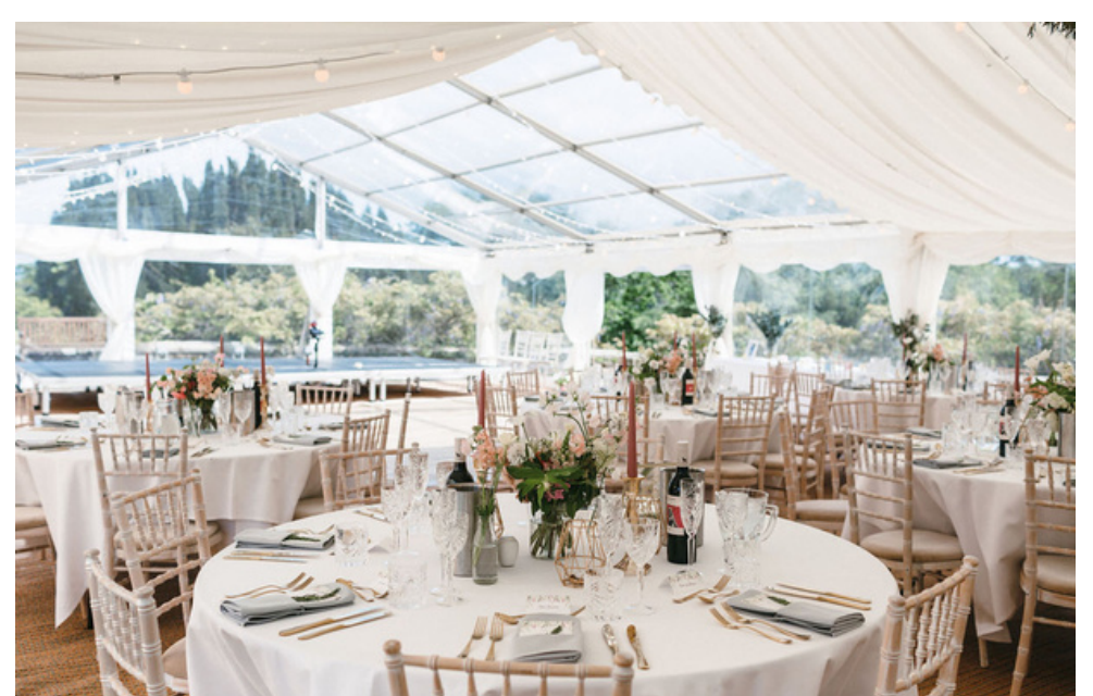
Emily & Rich's sustainable outdoor wedding