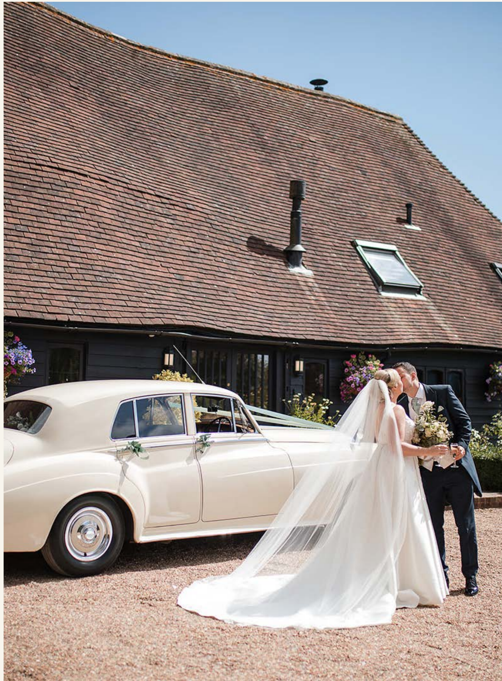
The Old Kent Barn