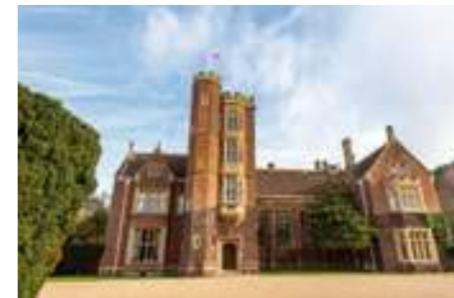
ST AUDRIES PARK Somerset