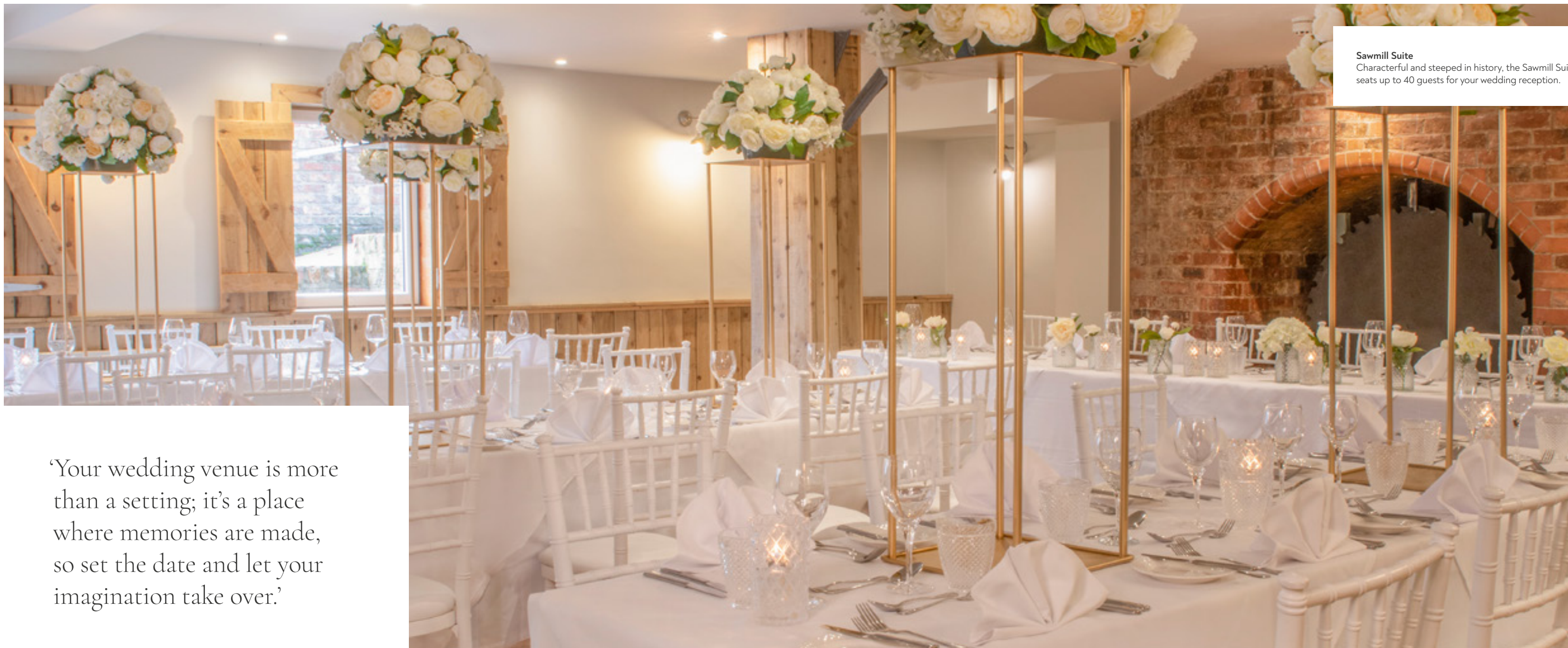
Sawmill Suite Characterful and steeped in history, the Sawmill Suite seats up to 40 guests for your wedding reception.

‘Your wedding venue is more than a setting; it’s a place where memories are made, so set the date and let your imagination take over.’