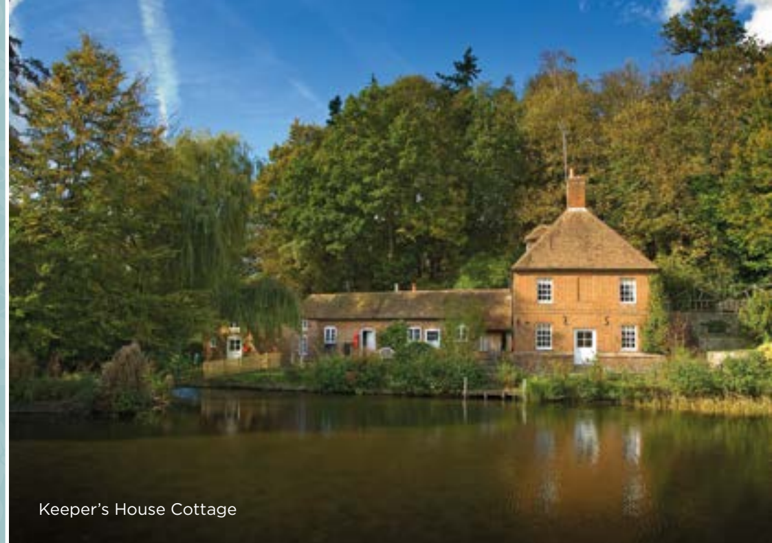
Keeper's House Cottage

Our Lakeside Lodges offer a truly unique and unforgettable experience, with breathtaking views overlooking the Great Water. Designed with meticulous attention to detail, they offer a perfect blend of contemporary design and timeless charm, harmonising with the picturesque surroundings.