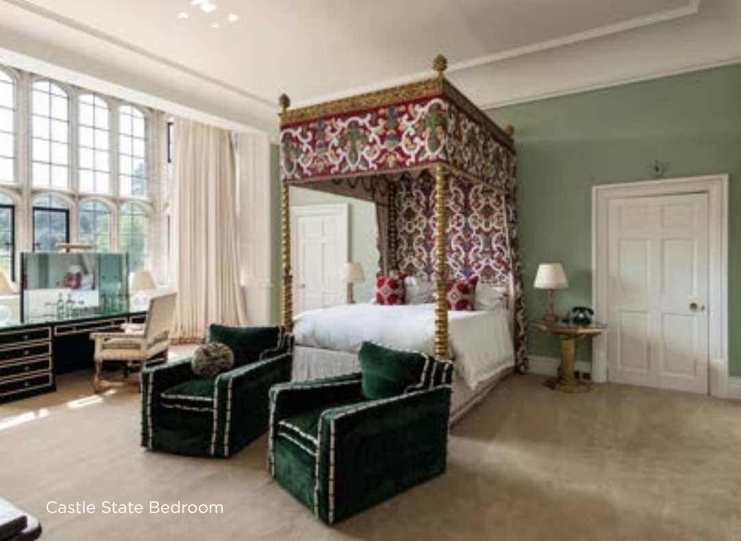
Castle State Bedroom