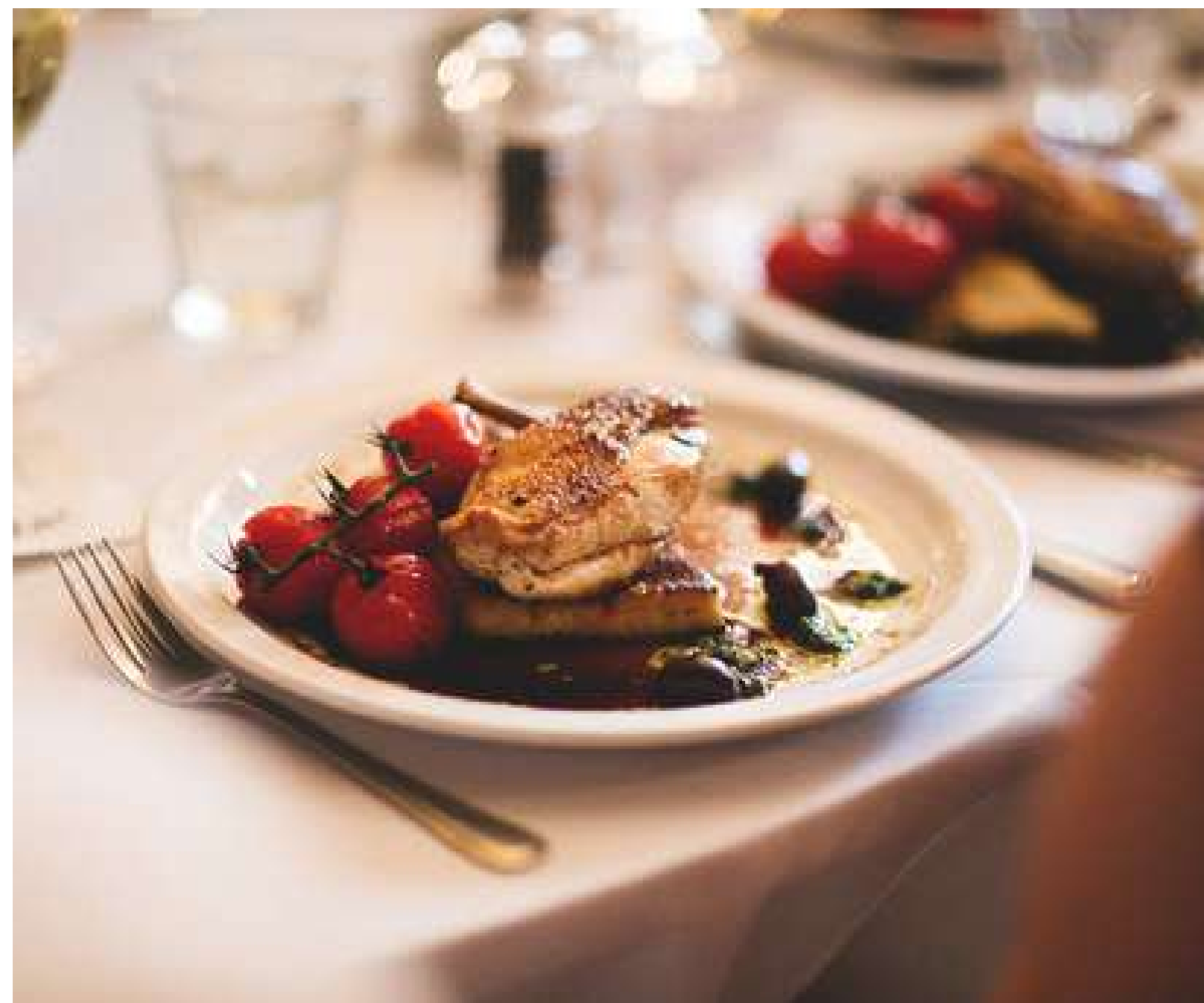
Roasted chicken breast with sage butter, artichoke and salsa verde served with dauphinoise potatoes and seasonal veg (gf)