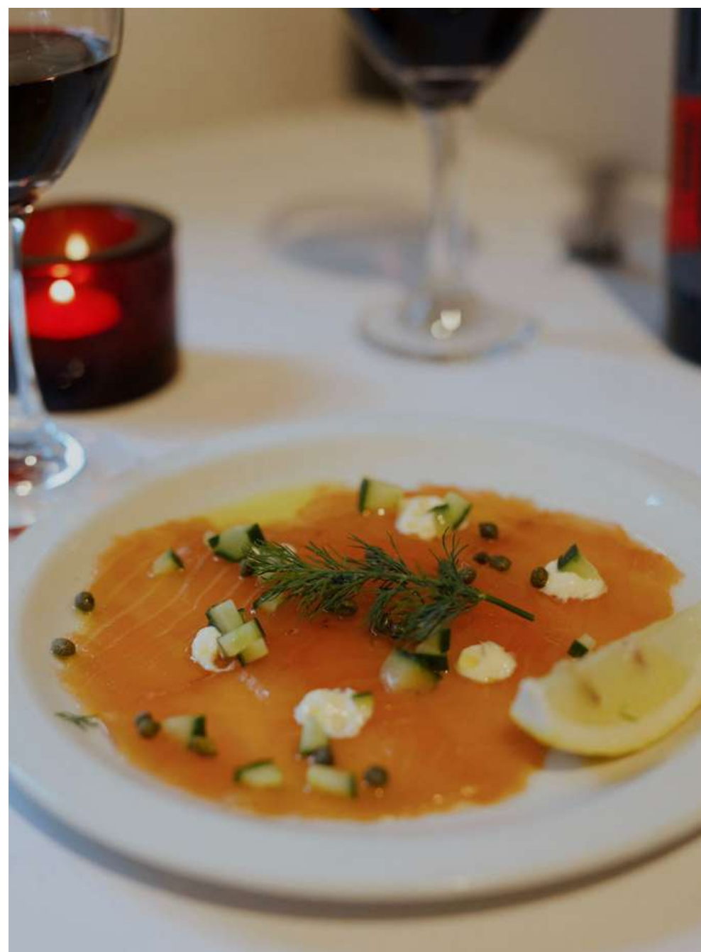
Cured salmon with crème fraiche, capers dill and cucumber (gf,nf)