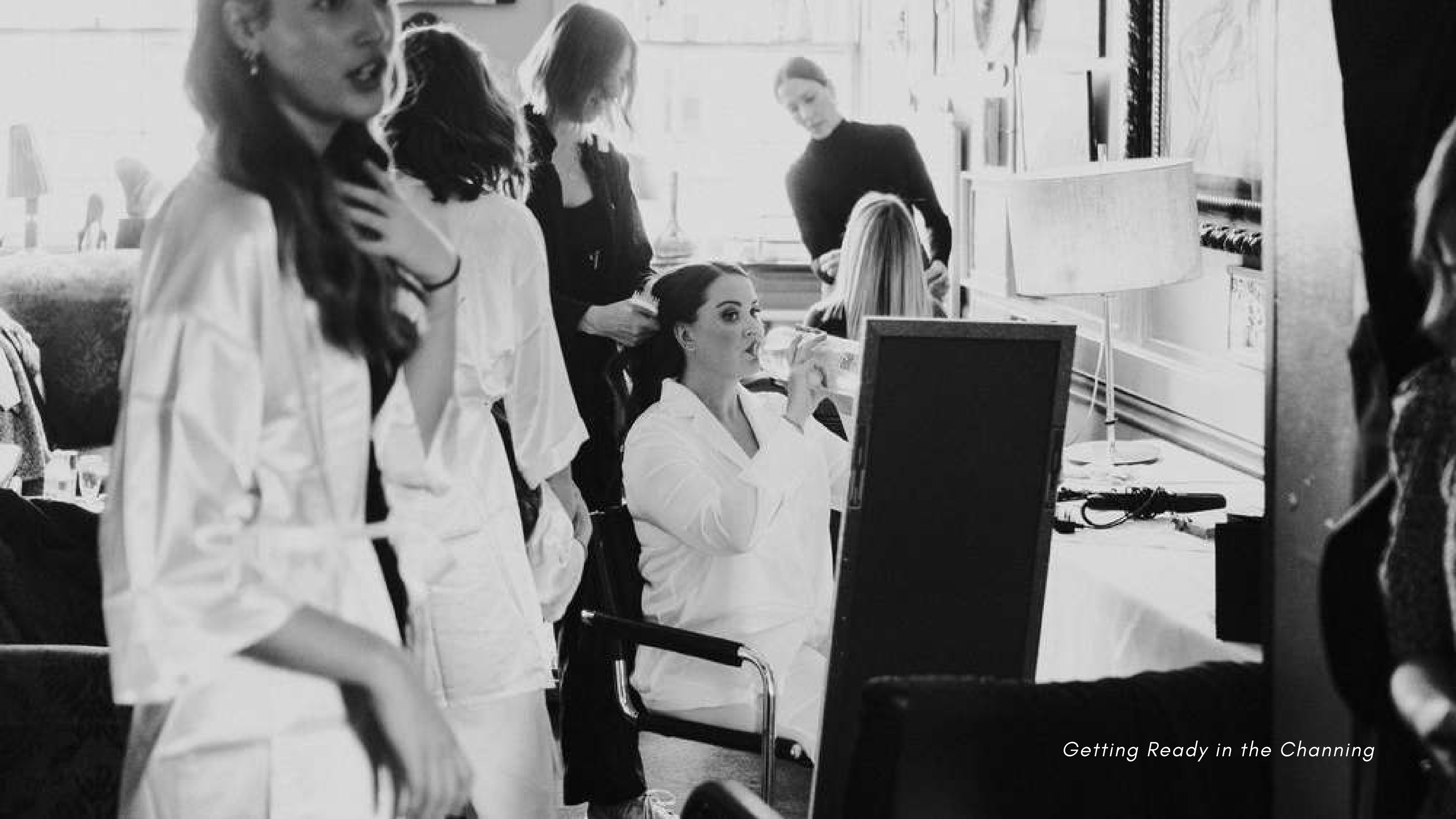
Getting Ready in the Channing