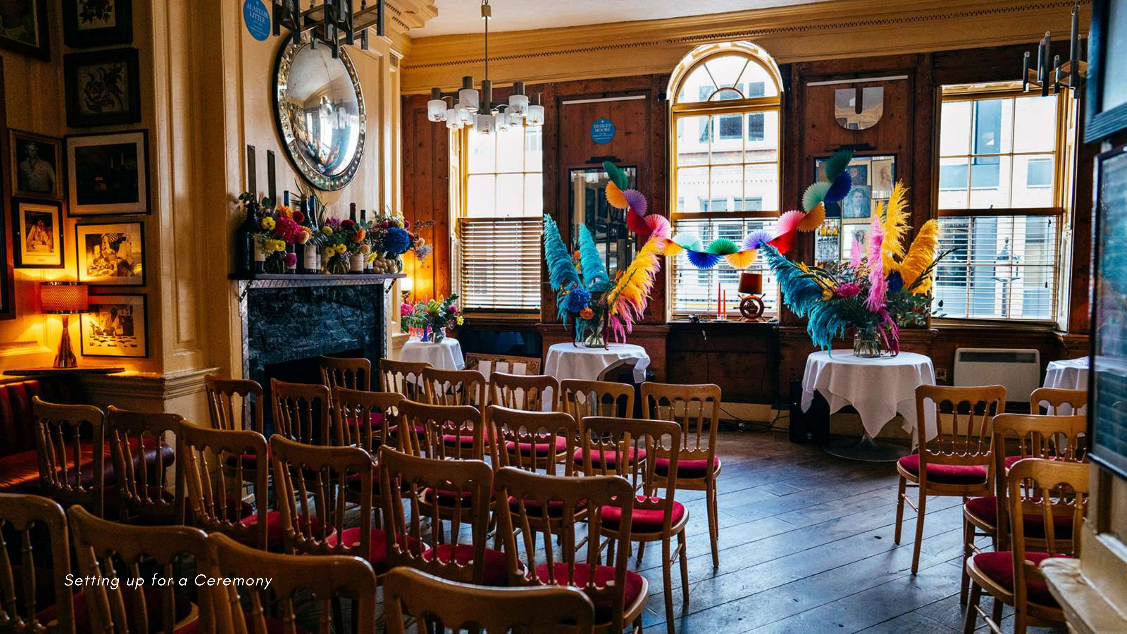
Setting up for a Ceremony