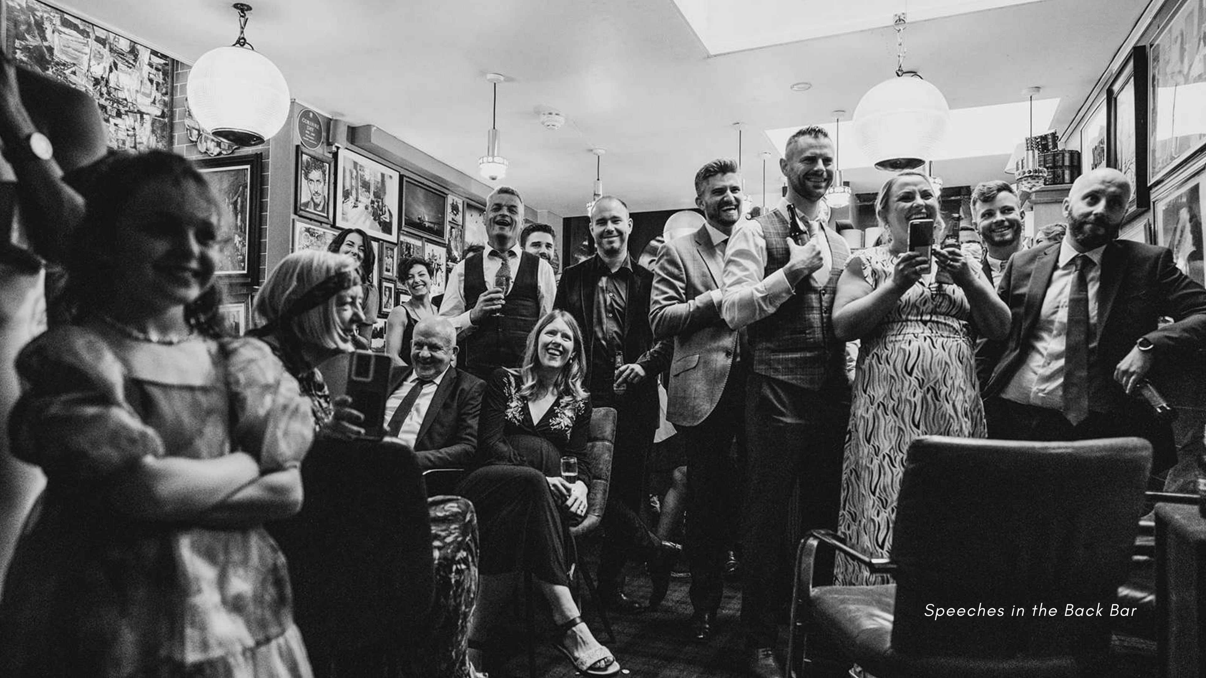
Speeches in the Back Bar