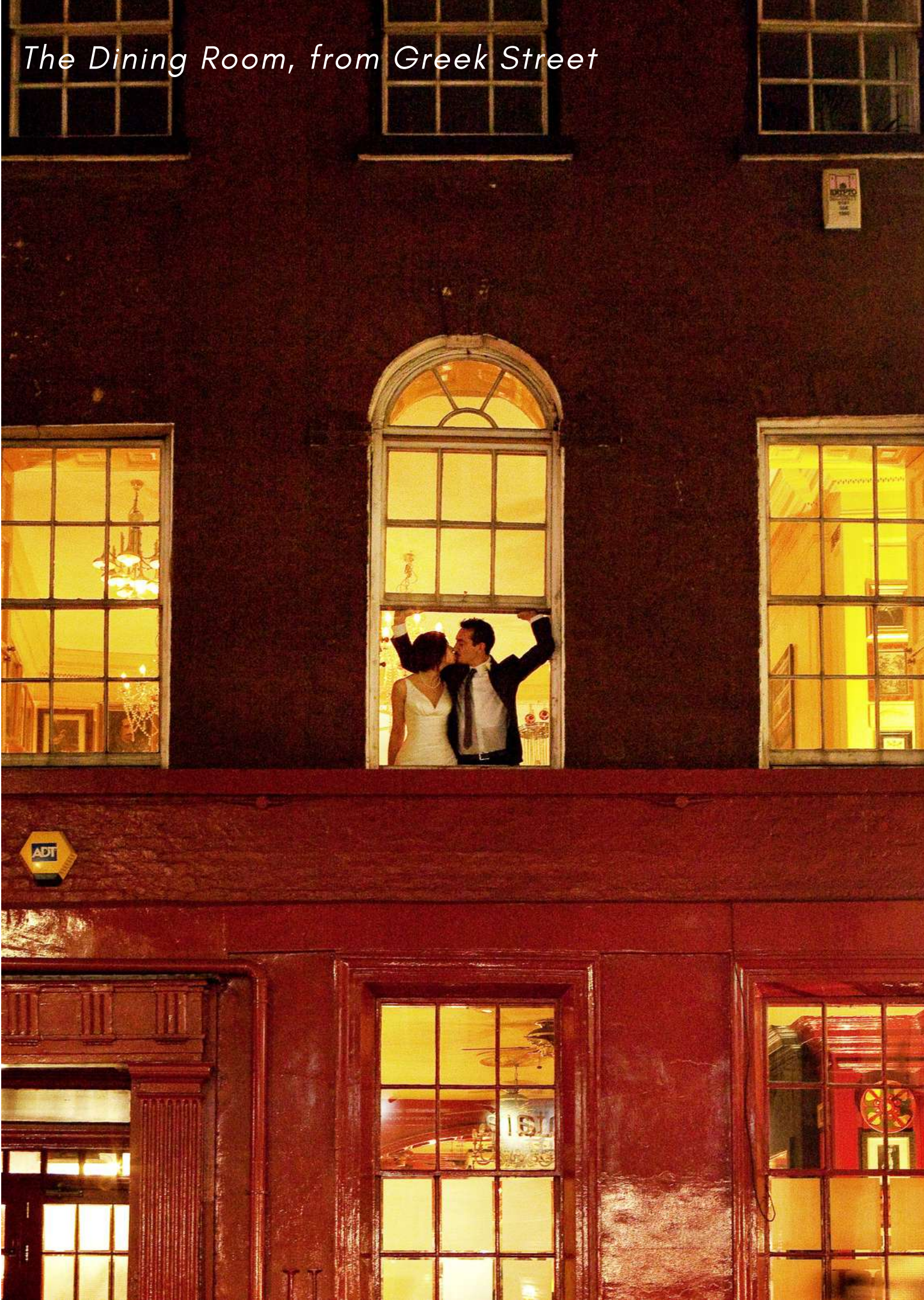
The Dining Room, from Greek Street