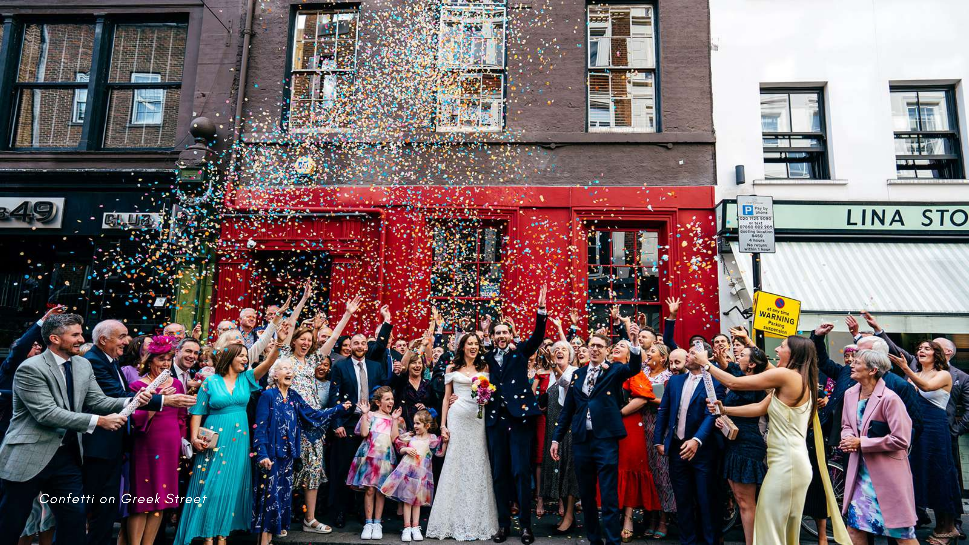
Confetti on Greek Street