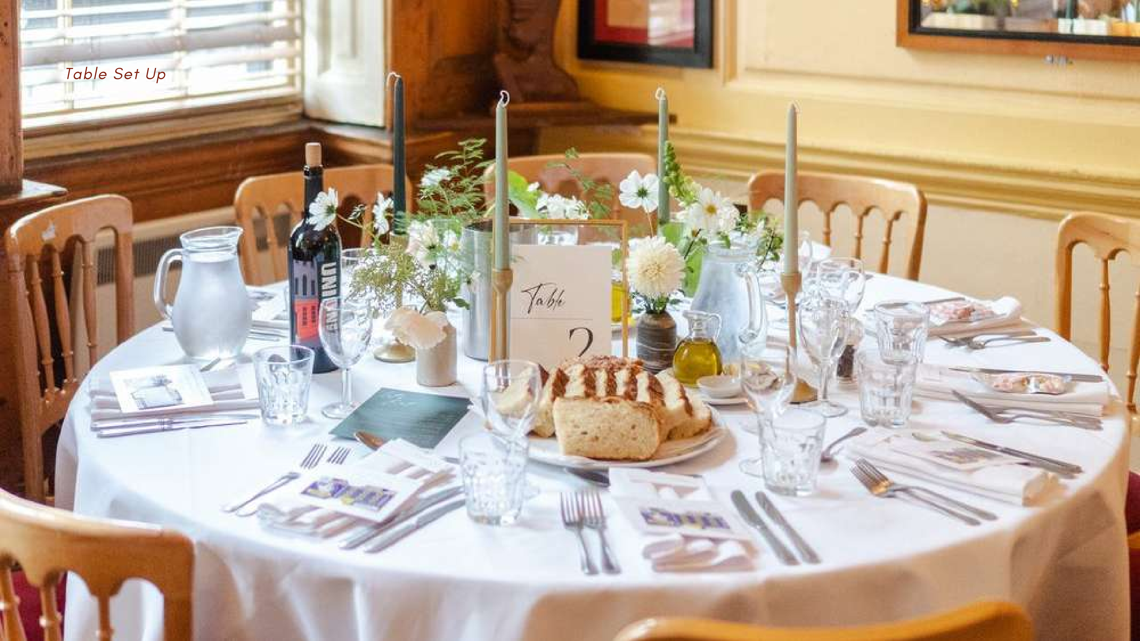
Table Set Up