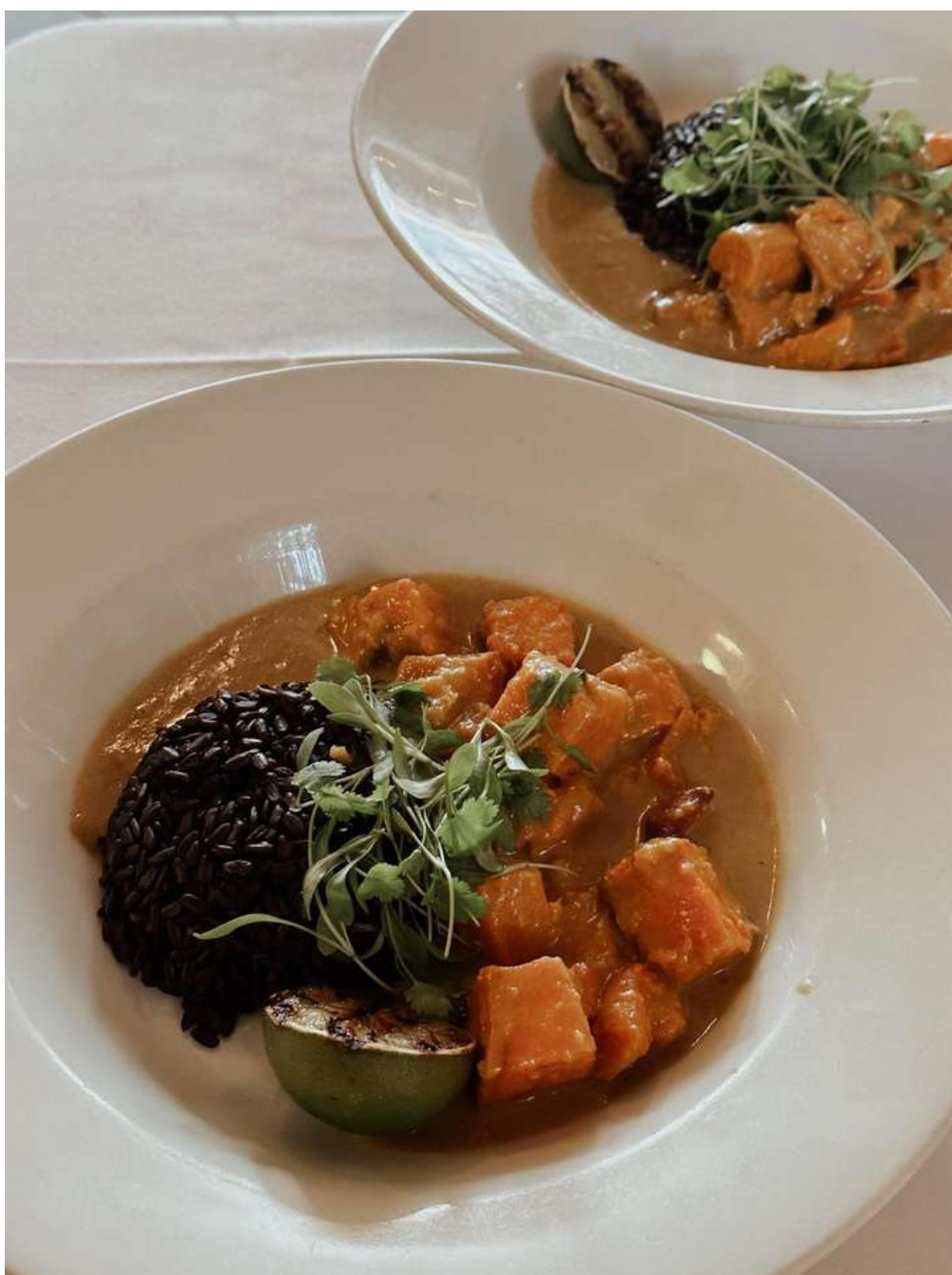
Butternut squash and chickpea curry, black venus rice, crispy shallot and coriander (vg)