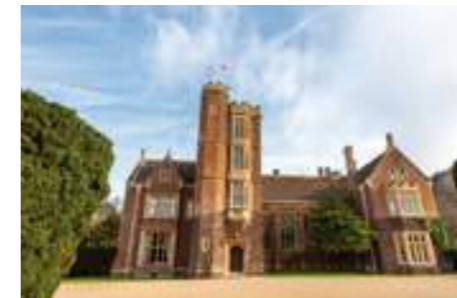
ST AUDRIES PARK Somerset