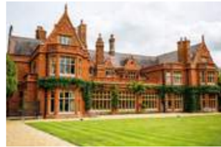
HOLMEWOOD HALL Cambridgeshire

Each venue is used purely to hold one wedding per day allowing our couples to enjoy a real tailor-made wedding experience. Our venues each have their own full-time team of staff and managers that are highly trained and dedicated entirely to delivering dream weddings for our couples.