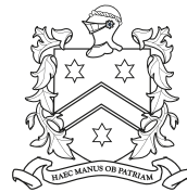
BOURTON HALL WARWICKSHIRE