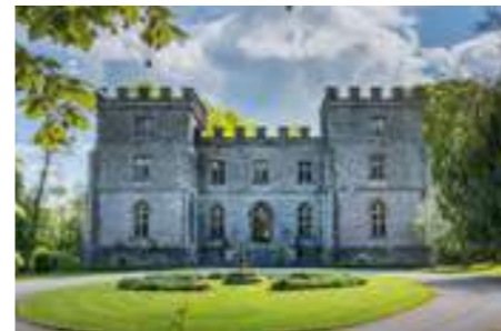
CLEARWELL CASTLE Gloucestershire