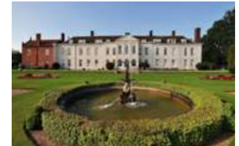
GOSFIELD HALL Essex