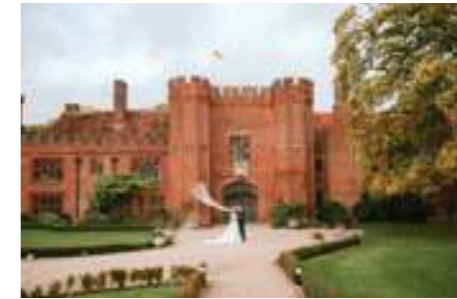
LEEZ PRIORY Essex