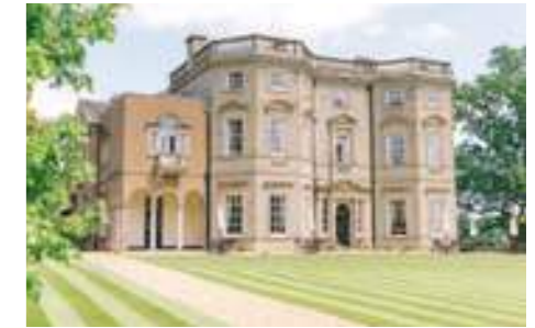
BOURTON HALL Warwickshire