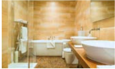
ROOM 5 Our most romantic suite