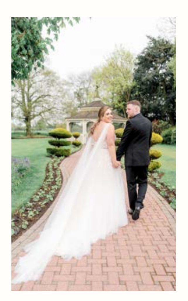
All privileges are subject to availability and change.

It is an honour to be considered as the venue for your wedding day. Upon confirming your big day at Thornton Hall Hotel, you will be welcomed into our Wedding Privilege Club. Your membership will last from the date you confirm, to your 1st wedding anniversary. These are the privileges you will be entitled to: