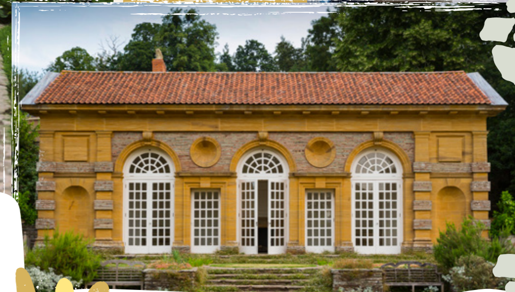
Charming historical orangery