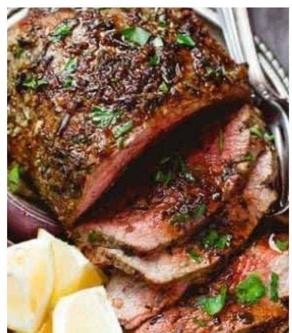
A CELEBRATIONAL FEAST