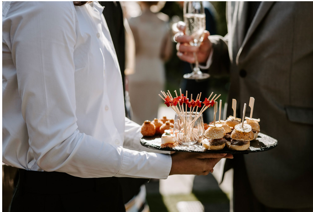
Serving seasonal ingredients with style.

Pennyhill Park is also home to the Michelin-starred Latymer restaurant. Make a reservation the night after your wedding to relax and unwind, indulging in exquisite cooking, worthy of the most important celebration of your life.