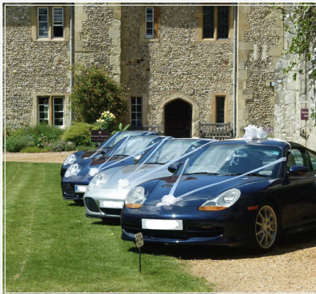
ON THE DAY

The marquee may be erected 2-3 days before your wedding. So that everything is ready in good time, your suppliers may have access the day before your event to arrange flowers, deliver drinks or other provisions. Please ask us if you have any special requests. Most celebrations finish by 11.00pm out of respect for the Brothers who live there.