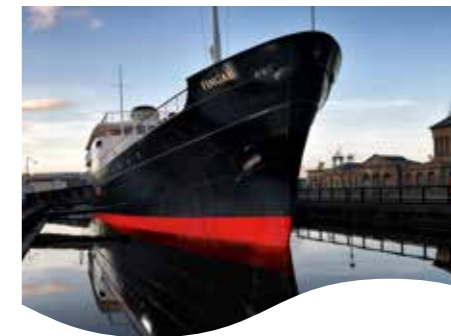
Photo opportunities everywhere. A crew whose sole aim is to ensure that every single detail is taken care of, proud to be entrusted with creating the memories you'll treasure forever.

A wedding venue truly like no other. Curved walls, portholes, deck spaces and 22 luxurious cabins for your guests. The magnificent Skerryvore Suite for the newlyweds.