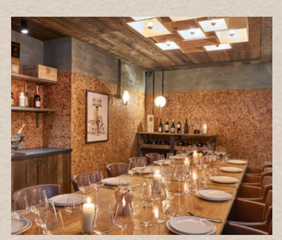
Humble Grape Fleet Street 1 SaiNt Bride's Passage, London, EC4Y 8EJ