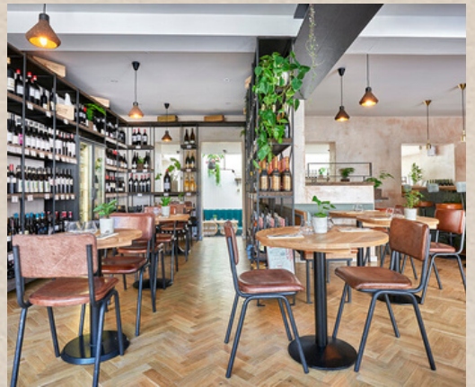
Humble Grape Islington 11-13 Theberton Street, London, N1 OQY