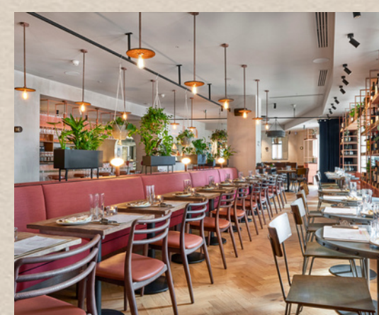
Humble Grape Canary Wharf 18-20 Mackenzie Walk, London, E14 4PH