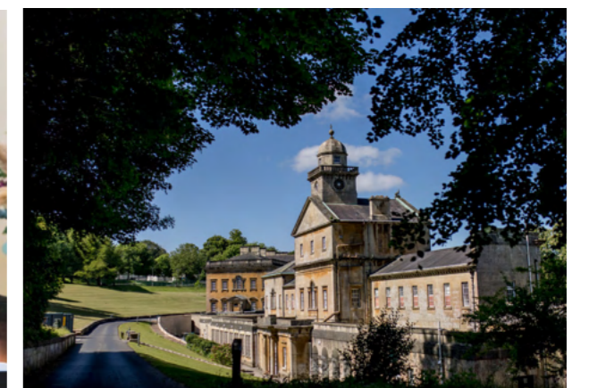
Prior Park Bath Grounds