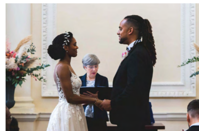
John Wood Chapel