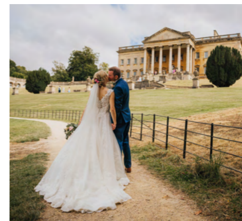
Prior Park Bath Grounds