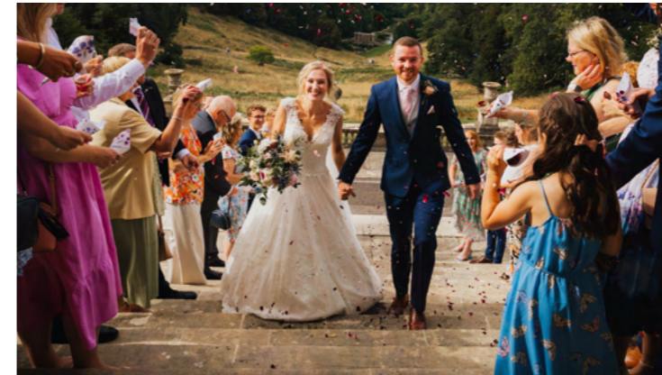
The Portico Steps