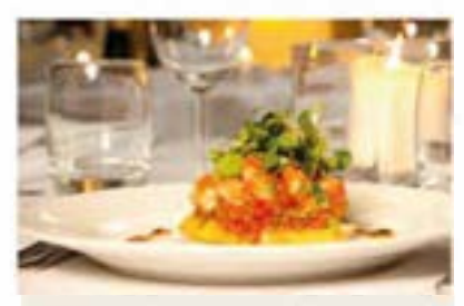
Choices Menu From £3.50 Upgrade your menu with 3 starters, 3 mains and 2 desserts