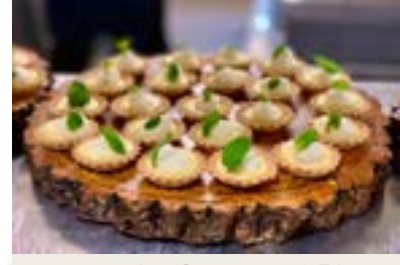
Reception Canapes £12.50 the perfect drinks reception accompaniment