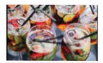
Unlimited Pimms Reception £11.50 1hr unlimited Pimms, frizzante, bottles of Peroni and elderflower fizz