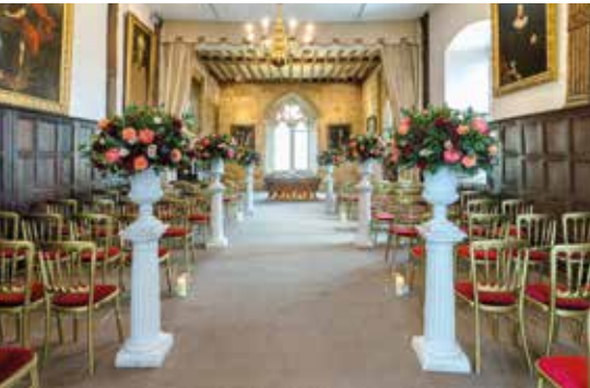
The Sunderland Room