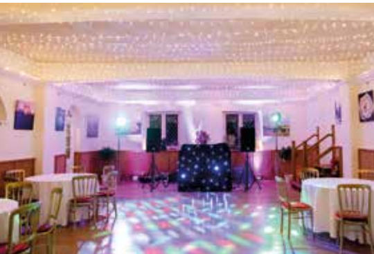
The Garden Room