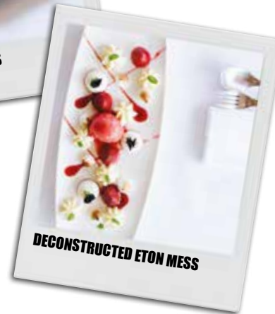
DECONSTRUCTED ETON MESS