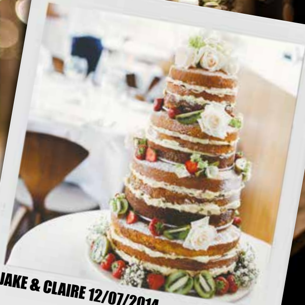
JAKE & CLAIRE 12/07/2014