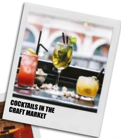
COCKTAILS IN THE CRAFT MARKET