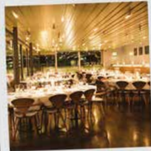
TOP FLOOR SEATING AT NIGHT